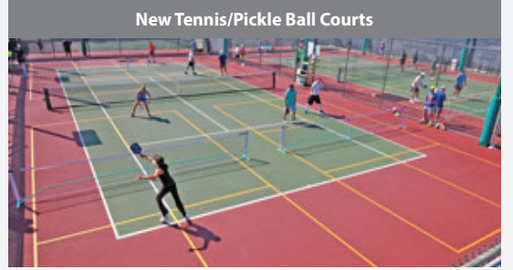
Examples of the types of spaces that could be achieved in Bond 2020