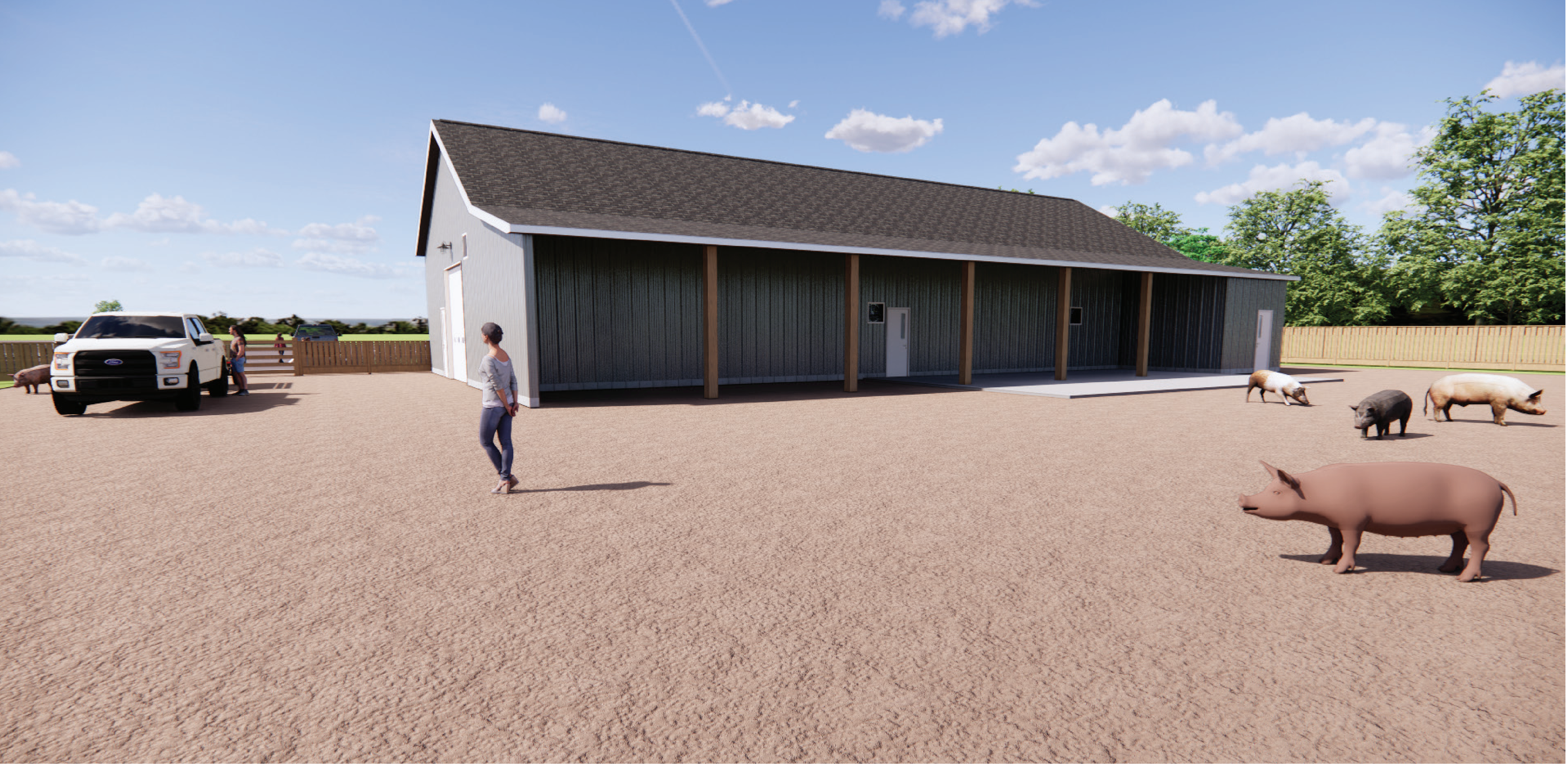
Conceptual Renderings of the New Agricultural Center