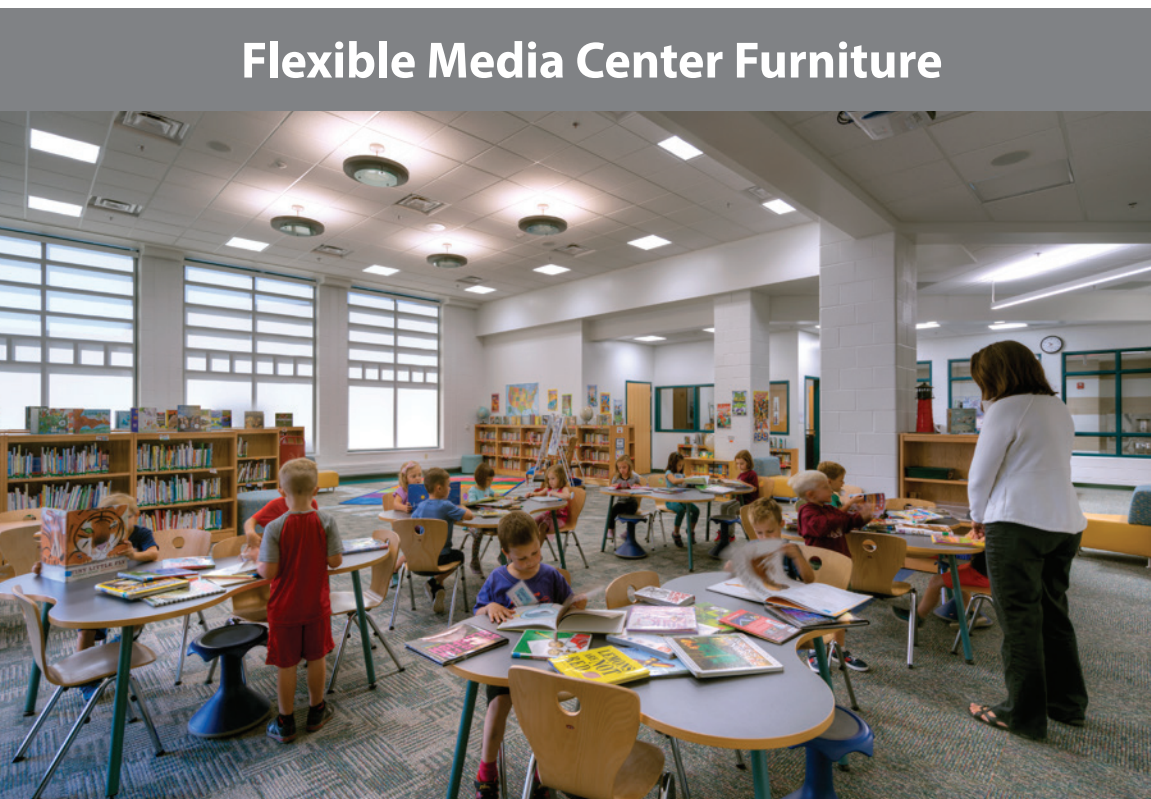
Examples of the types of spaces that could be achieved in Bond 2020