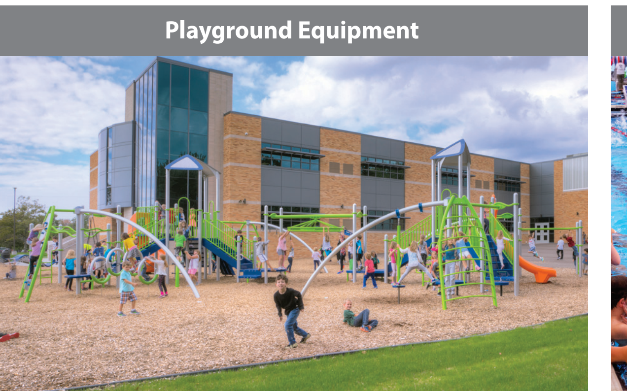
Examples of the types of spaces that could be achieved in Bond 2020